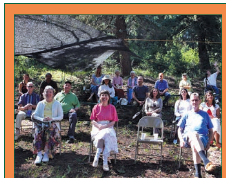
Sunday pre-class photograph of the Pagosa Springs 2007 banquet.