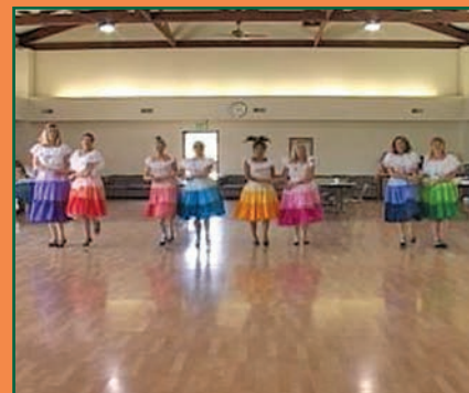
New Life Pretties dancing at Pagosa Springs 2007 banquet.