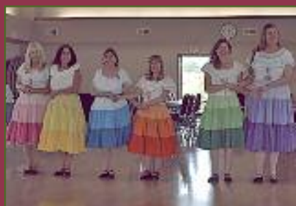
Pretties Performing at July Banquet

(This is from the book Inspire Yourself )